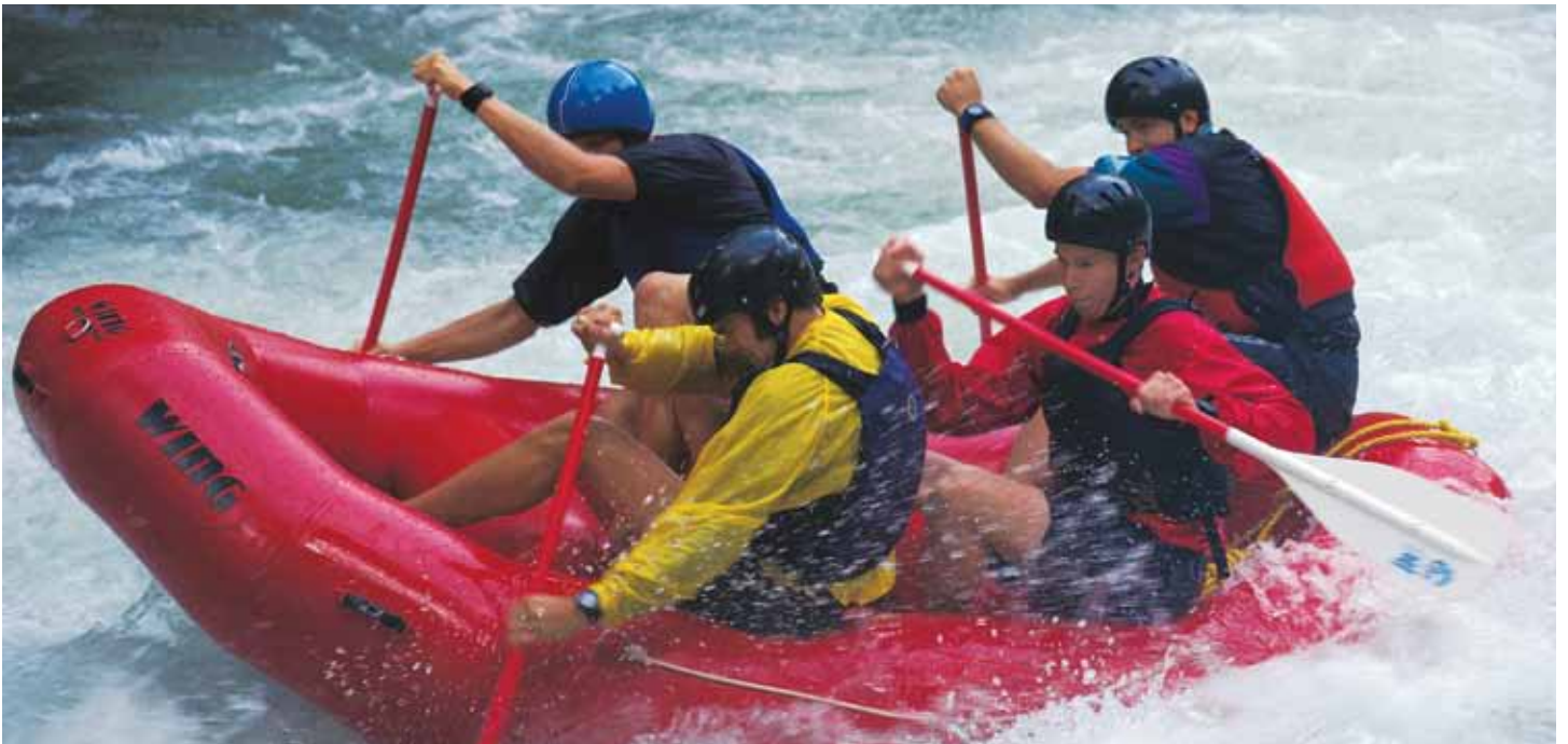
Whitewater fans will soon be able to shoot the rapids close to home.

with Boise Parks and Recreation staff to raise funds for the development, mainly through donations from private contributors. The Idaho-based J.A. and Kathryn Albertson